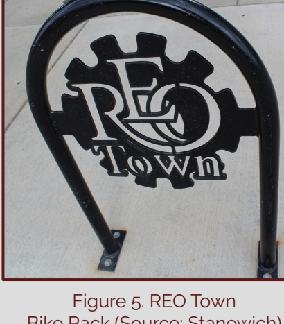
Bike Rack