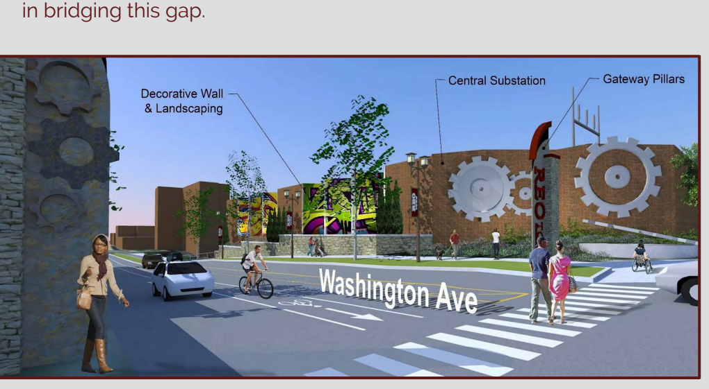
Figure 6. Rendering of Substation on S. Washington Avenue

REO Town is a great potential stopping point for bikers and pedestrians on The City of Lansing would like to see the incorporation of a District Mixed Use Center. This means current property owners will be encouraged to have commercial use on the ground floor and tenants in the upper floors if