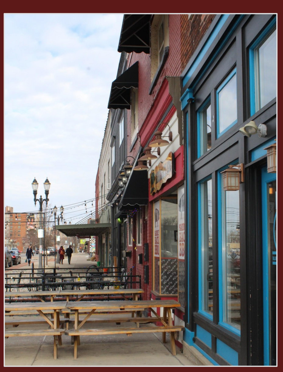
Figure 4. REO Town Outdoor Seating along S. Washington Ave

In the proposed REO Town Historic District, there are 42 building considered 'contributing' to the historic district and four buildings that are considered 'non-contributing' to the historic district.